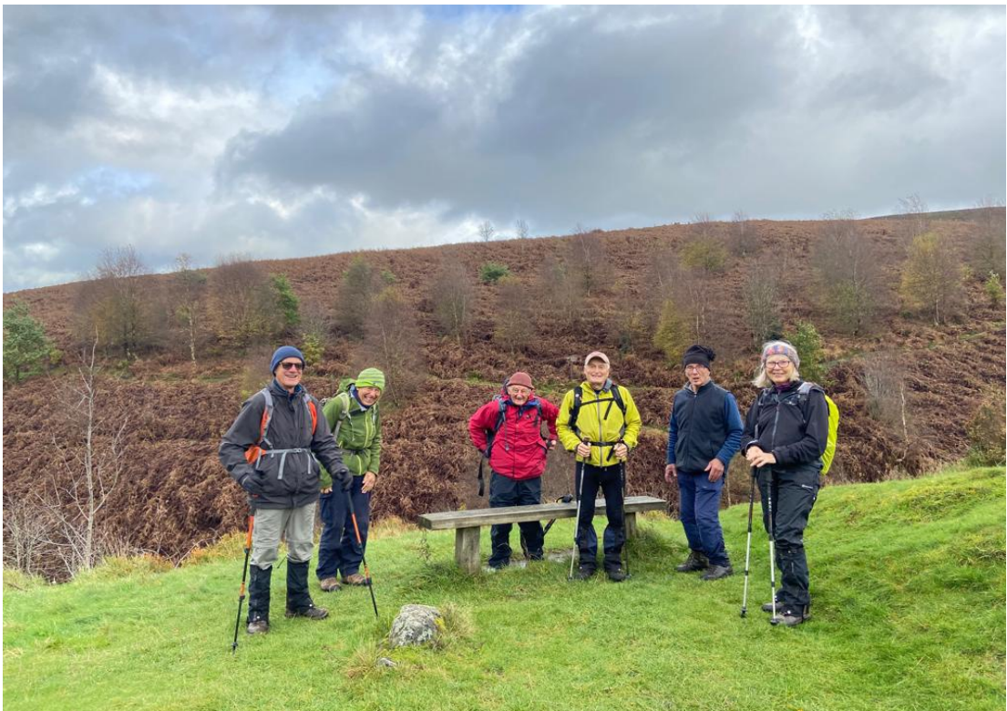
High on the moorland.